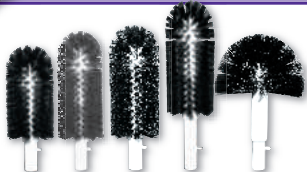
BRS-917 BRS-920 BRS-922 BRS-975 BRS-950